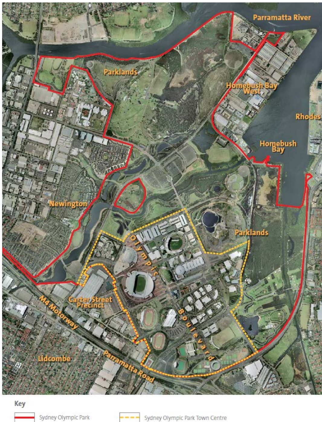
Figure 1: Sydney Olympic Park